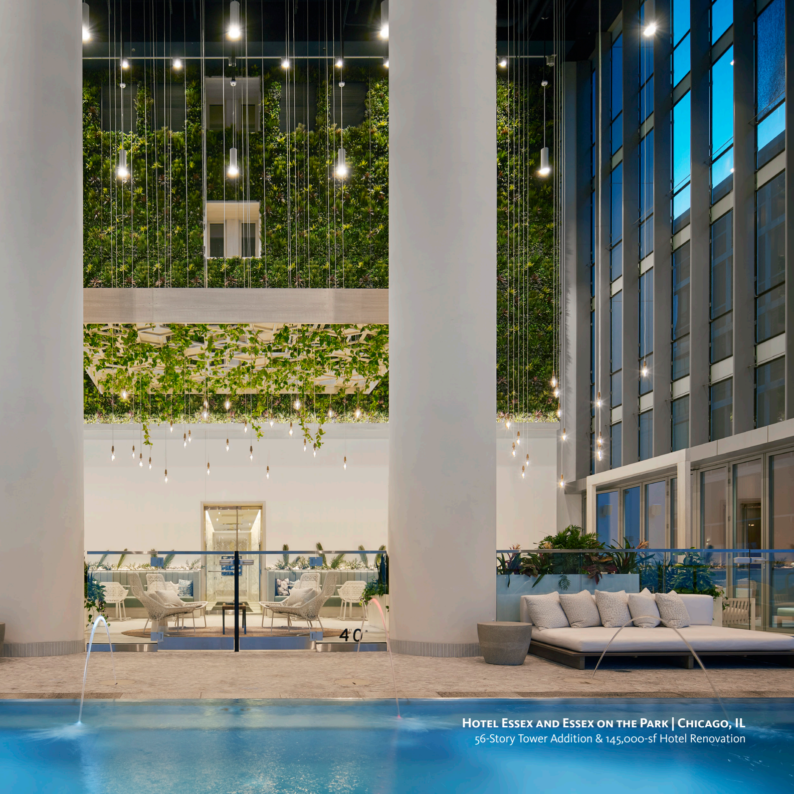
HOTEL ESSEX AND ESSEX ON THE PARK | CHICAGO, IL 56-Story Tower Addition & 145,000-sf Hotel Renovation