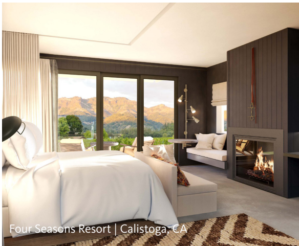
Four Seasons Resort | Calistoga, CA

With a full-suite of engineering design and infrastructure services along with consulting and advisory services , our clients come to us for our ability to handle a range of facility and infrastructure demands. Our work prioritizes performance and efficiency, leading to our reputation as one of the top engineering firms in the country. From this commitment and passion, we've earned hundreds of awards, including the highest honors in our engineering fields. But more than anything, we're proud of how our services put people and the experience at the forefront.