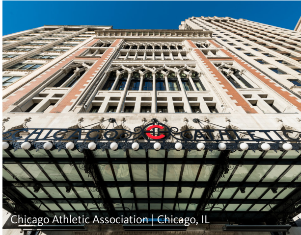
Chicago Athletic Association | Chicago, IL