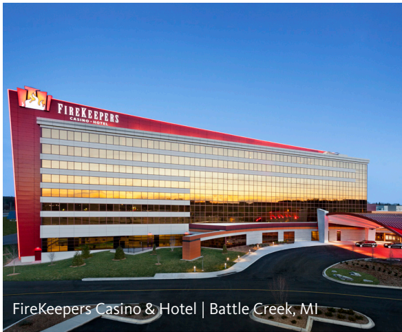
FireKeepers Casino & Hotel | Battle Creek, MI