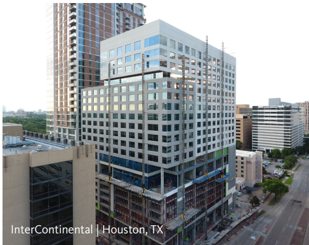
InterContinental | Houston, TX

At IMEG we understand the multi-layered design elements that create an inviting and memorable guest experience. Our hospitality designs meet the unique needs of each individual project and are shaped by our intense interaction with all stakeholders — leading to our Top 3 Hotel Sector Engineering Firm ranking.