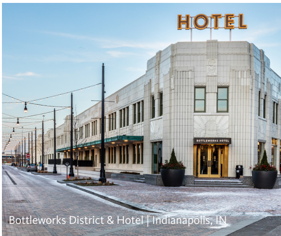
Bottleworks District & Hotel | Indianapolis, IN