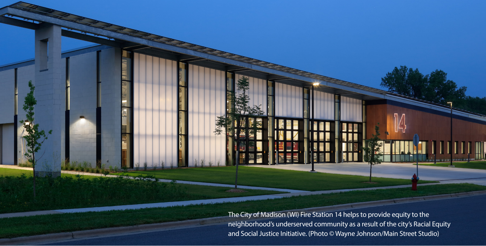
The City of Madison (WI) Fire Station 14 helps to provide equity to the neighborhood's underserved community as a result of the city's Racial Equity and Social Justice Initiative.

— additionally provides residents the use of a community room. While the author also discussed the highly efficient systems we designed for the LEED Platinum station, the fact that he first pointed out the project's positive impacts on the community speaks volumes.