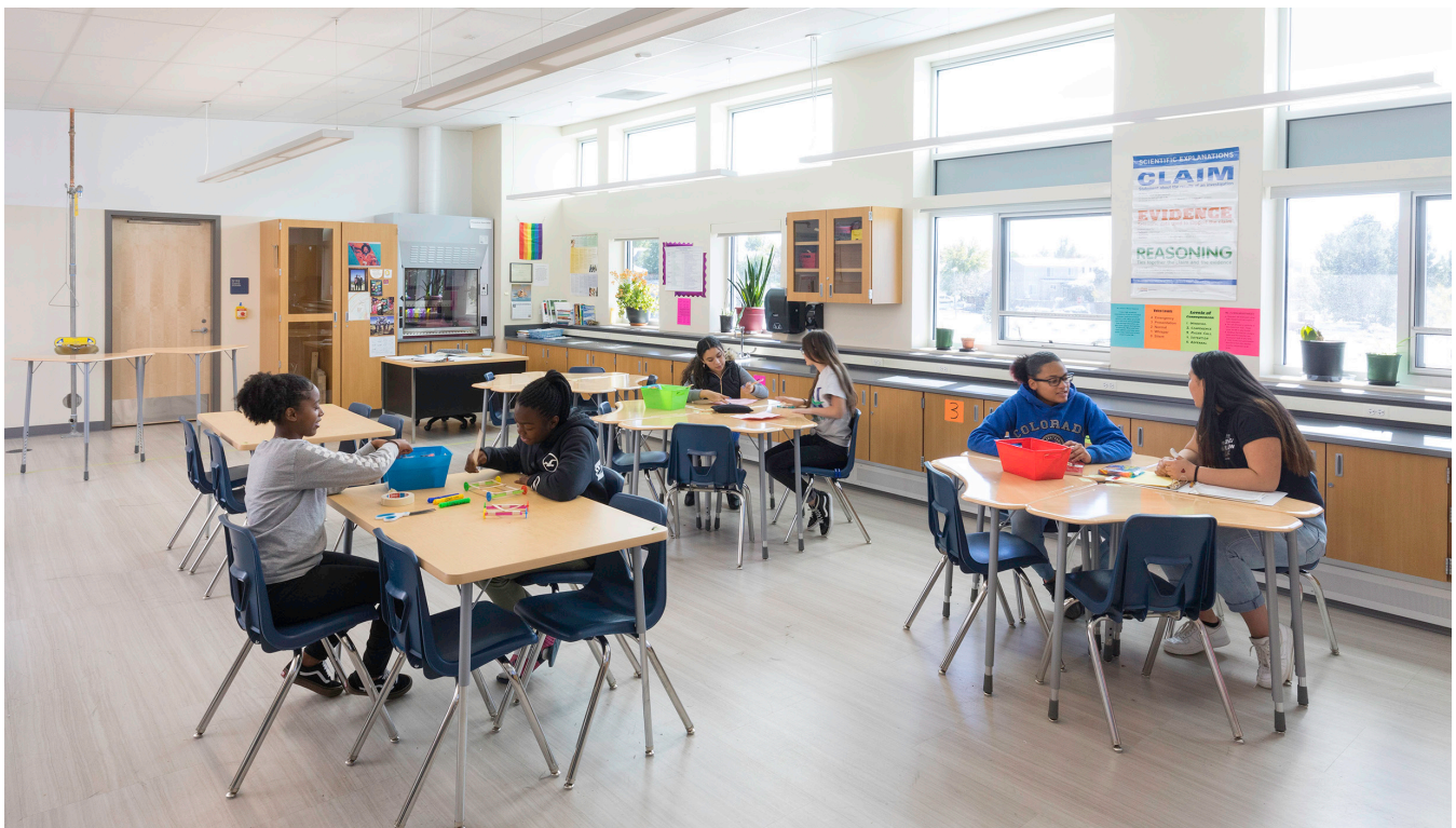
Data will enable engineers to analyze relationships between indoor environments and occupants, such as the effects of daylight on student test scores.