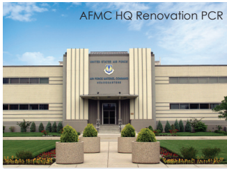
AFMC HQ Renovation PCR