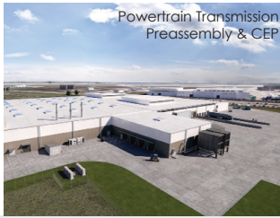
Powertrain Transmission Preassembly & CEP