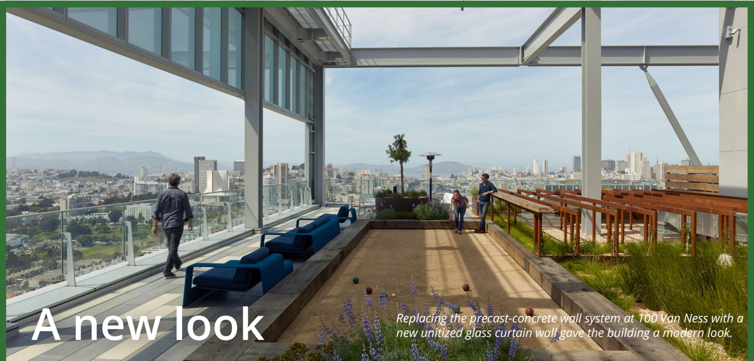
Replacing the precast-concrete wall system at 100 Van Ness with a new unitized glass curtain wall gave the building a modern look.

To make the building attractive to the marketplace, it's important to update the exterior. Removing outdated and heavy exterior systems can improve aesthetics and energy efficiency. When IMEG worked on the conversion of 100 Van Ness , a 1970s-era office building in San Francisco, the original precast-concrete wall system was replaced with a new unitized glass curtain wall.