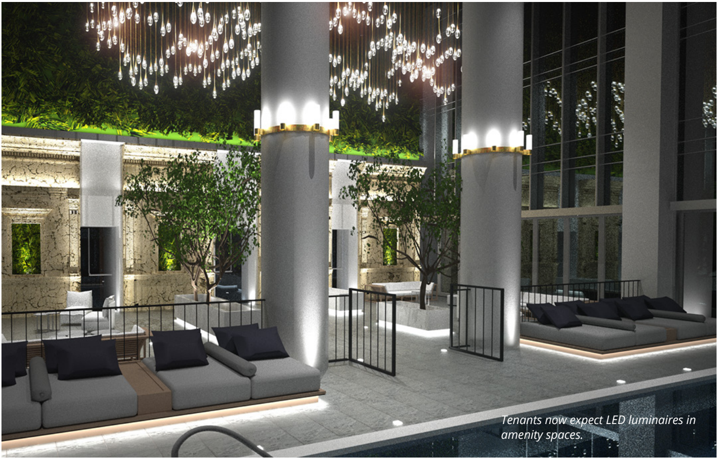
Tenants now expect LED luminaires in amenity spaces.