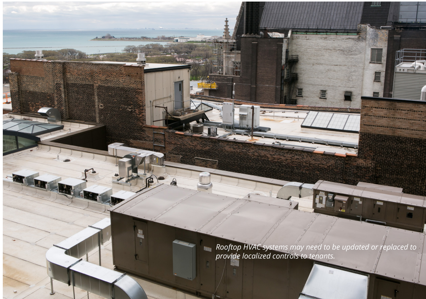
Rooftop HVAC systems may need to be updated or replaced to provide localized controls to tenants.