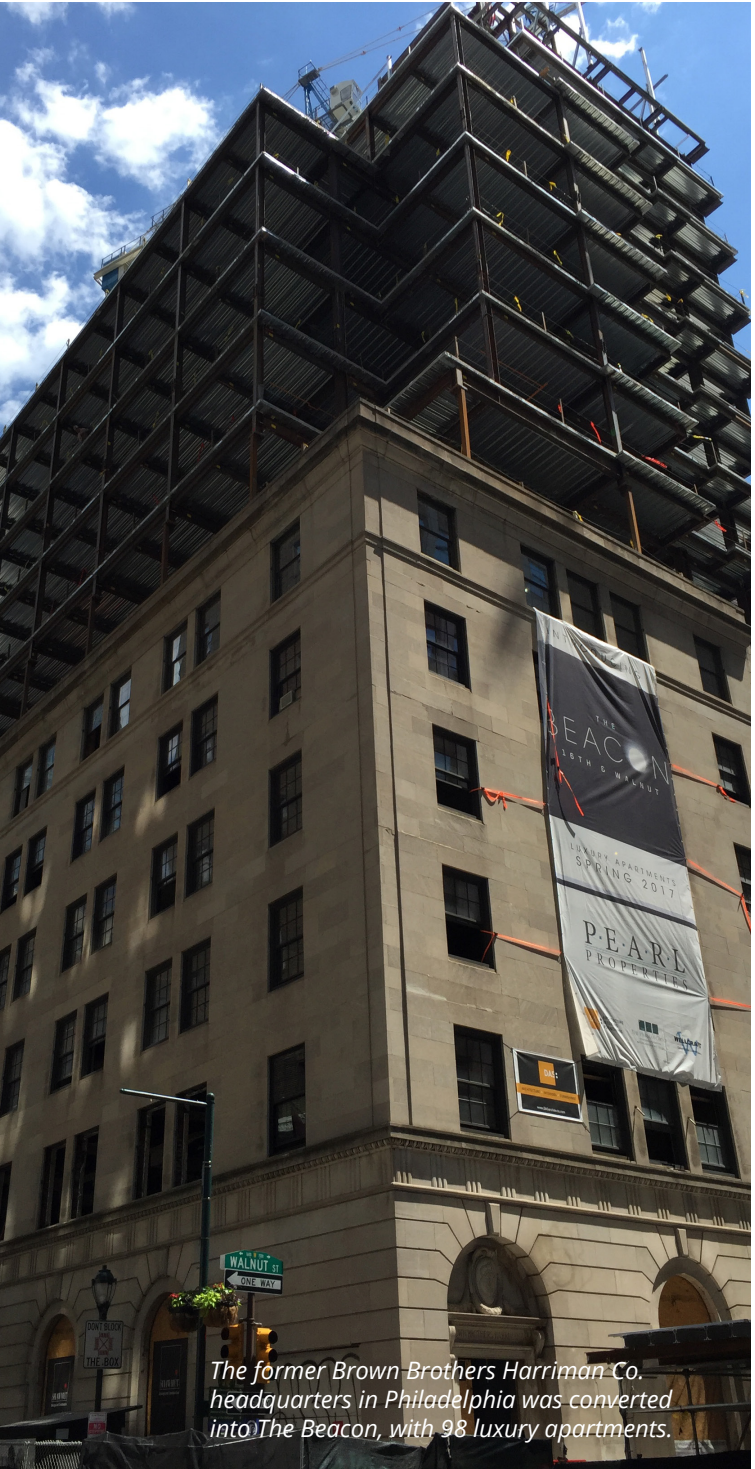
The former Brown Brothers Harriman Co. headquarters in Philadelphia was converted into The Beacon, with 98 luxury apartments.